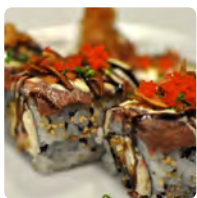
Surf and Turf * Tempura shrimp, crab salad, cream cheese, seared steak, balsamic soy, aioli, garlic chips, chives. 13