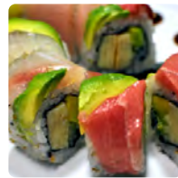
Rainbow Roll * California roll wrapped with salmon, tuna, snapper, white tuna, avocado. 13