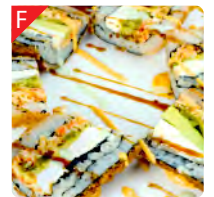
Crunchy Diablo Spicy crab, avocado, cream cheese, jalapeño. Panko fried, topped with spicy mayo, eel sauce. 11