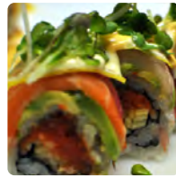
Secret Garden * Spicy tuna, cucumber. Avocado, salmon, lemon slices, seafood sauce, micro wasabi on top. 14