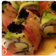
Sake Bomb * Salmon, avocado, yamagobo, yellowtail, spiced ponzu, tobiko, chives. 14