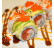
Oishi Roll * Spicy tuna, kani crab, tempura crunch, seared white tuna, avocado, masago, special sauces. 13