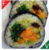
Green Giant Sweet potato tempura, seaweed salad, avocado, kanpyo, cucumber. 8