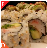
Real Cali Real snow crab, avocado, kaiware. 12