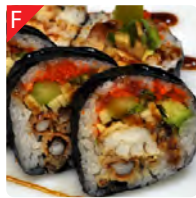
Spider Soft shell crab, avocado, kaiware, masago, eel sauce on top. 11