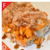
Baked Volcano Kani crab, avocado, salmon, spicy scallop. Baked & served with eel sauce, wasabi aioli, shichimi. 15