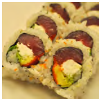
Peppered Tuna * Ahi big eye tuna, avocado, kaiware, masago, goat cheese, black pepper. 11