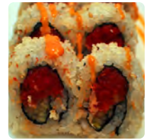
Spicy Tuna Crunch * Spicy tuna, cucumber. Tempura flakes, spicy mayo outside. 9