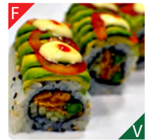
Ratatouille Inari, cucumber, kaiware, seaweed, topped with shichimi, avocado, tomato, goma dressing. 9