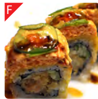
Twisted Mango Tempura shrimp, cucumber, mango, spicy crab, serrano peppers, goma dressing, sweet chili sauce. 12