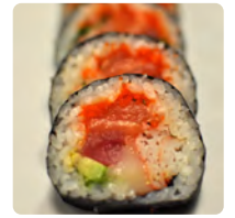
V.I.P. * Tuna, salmon, white tuna, kani crab, cilantro, avocado, masago, kaiware. 13