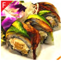
Dragon Tempura shrimp, crab salad, cucumber. Unagi, avocado, eel sauce on top. 13