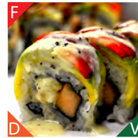
Skittles Banana chips, cucumber, mango, cantaloupe, avocado, strawberries, goma dressing. 9