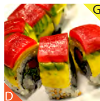
Traffic Light * Salmon, white fish, cucumber. Avocado, mango, tuna on top. 14