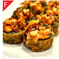
Magma Crab salad, avocado flash fried. Scallop mix, wasabi mayo, eel sauce on top. 13