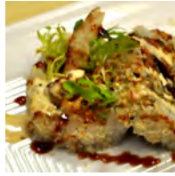
French Kiss * Spicy yellowtail, soft shell crab, frisée, kanpyo. Tempura crunch, screaming "O" sauce, eel sauce on top. 12