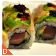
Hamachi Jalapeno * Spicy yellowtail, kaiware, seared albacore, avocado, jalapeño, spicy ponzu, tobiko, shichimi. - 15