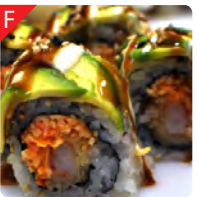
Piano Roll Spicy crab, shrimp tempura, avocado, wasabi aioli, soy glaze. 11