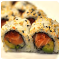
Orange Blossom * Scottish salmon, sundried tomato, avocado, flying fish roe. 10