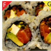
Pink Floyd Smoked salmon, avocado, mango, cream cheese, pistachio. 9