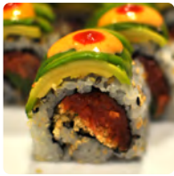
Angry Tuna * Spicy tuna, crunch, jalapeño, avocado, spicy aioli, chili paste, soy glaze. 12