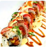
Screaming "O" * Spicy tuna, tempura shrimp, seared tuna, special "O" sauce, masago, chives. 14